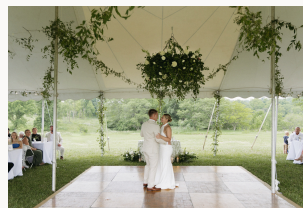
Table Centerpieces: $55+ Signage Flowers: $40+ Cocktail/Bud Vase Flowers: $18+ Deluxe Hanging Installation or Statement Designs: $500+